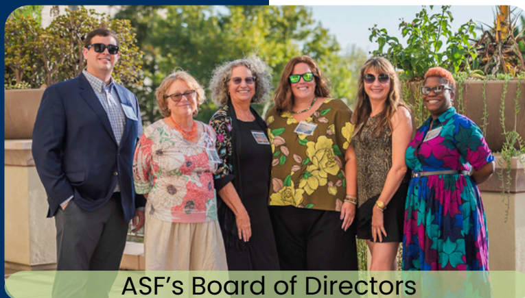
ASF's Board of Directors